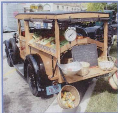
Everyone finds a favorite at Sharon. Jan thought this produce-filled Huckster produce was particularly tasty!

A few things were not changed. The barbecue was still the best in the land (although the line was HUGE) and the ever-present black clouds kept the sun off of the old cars, same as at many previous Ford Days. This year the clouds also flashed with lightening. And then came the rain! Vintage cars that had seen only an occasional bucket or two of water in 30 years were suddenly doused. Vacuum wipers were given a workout. Side curtains were snapped into place. And the little cars went home early!