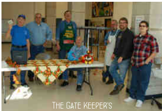
THE GATE KEEPER'S