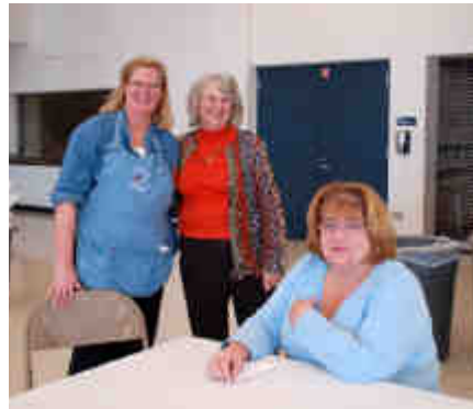
CHECKIN' THE TO-DO LIST